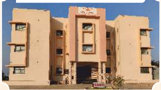
'Shree' Guest House