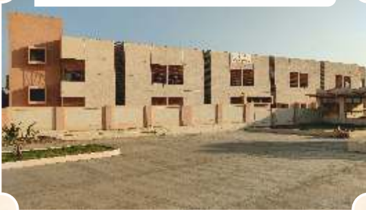
'Gargi' Girls hostel